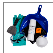
Chemical Spill Kit