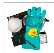
Mercury Spill Kit