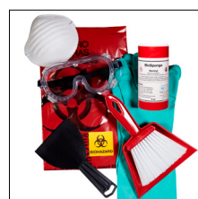
Biological Spill Kit