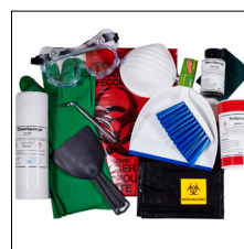
Master Spill Kit