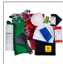
Master Spill Kit