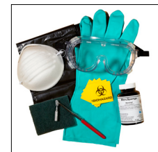
Mercury Spill Kit