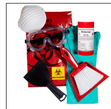
Biological Spill Kit