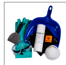
Chemical Spill Kit