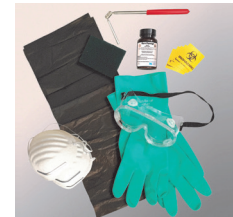
Mercury Spill Kit