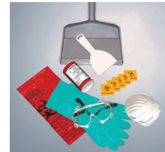
Biological Spill Kit