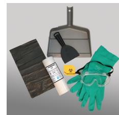
Chemical Spill Kit