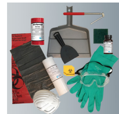
Master Spill Kit